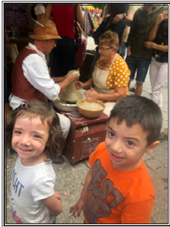
Pottery making at the Medieval Fair.