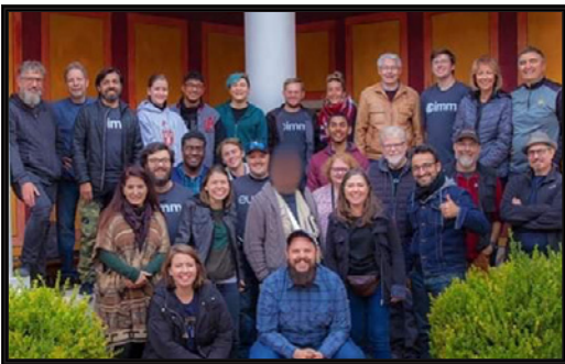
Team picture on last day.

Filming just wrapped up on the last episode of the Heritage Project! While there is still much work to be done to finalize the last four episodes, it is definitely an important milestone. If you would like to watch the first four episodes in English, you can do so on Amazon. Just look for them under the title Lost Legacy Reclaimed . One of them, The Scillitan Martyrs, has won two film awards since its release. These next few months the team will be focused on editing and finalizing the last four episodes, as well as continuing to work on the translations into the Berber language.