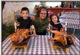
Trying the famous suckling pig!